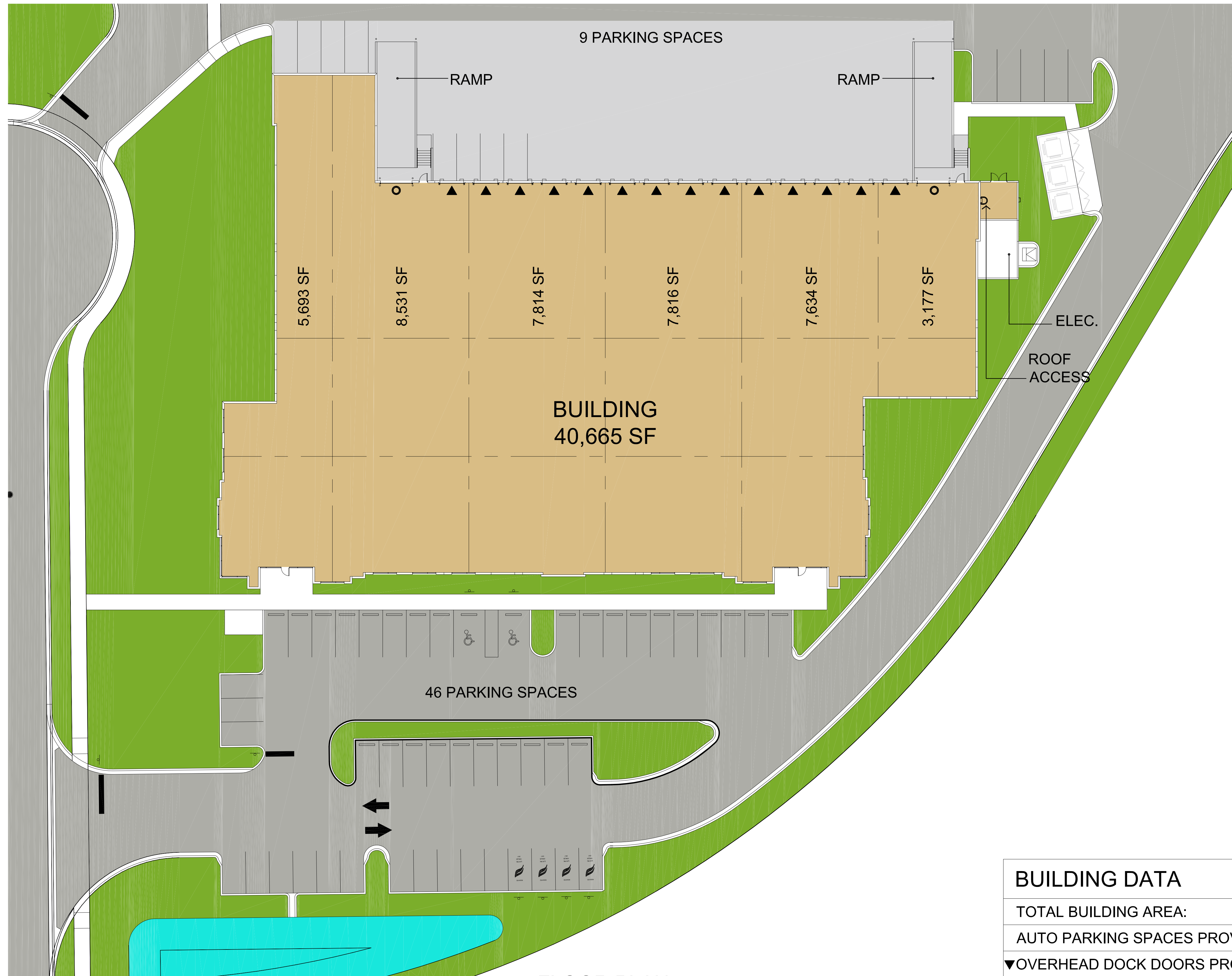
FLOOR PLAN 24'-0" CLEAR HEIGHT