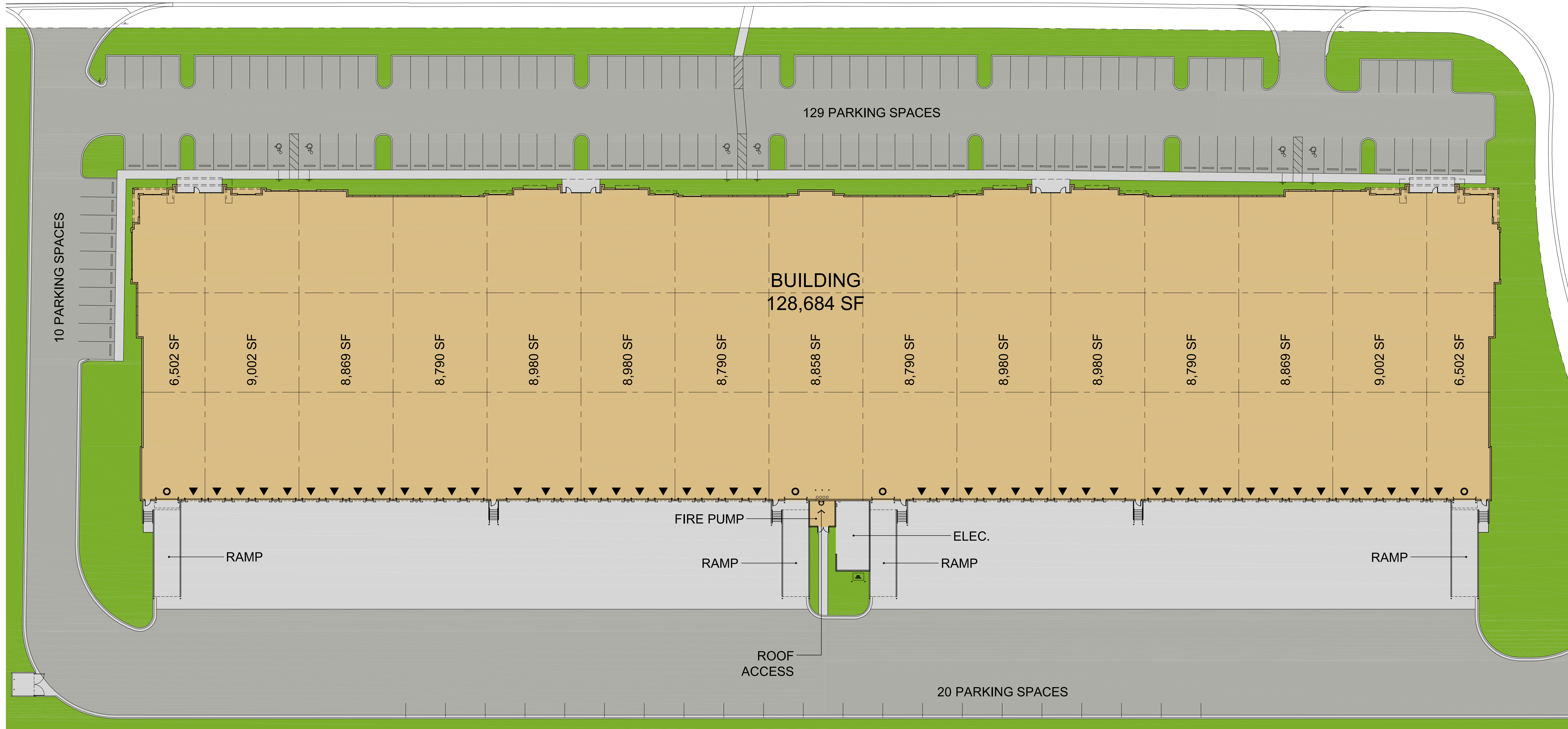
FLOOR PLAN 32'-0" CLEAR HEIGHT